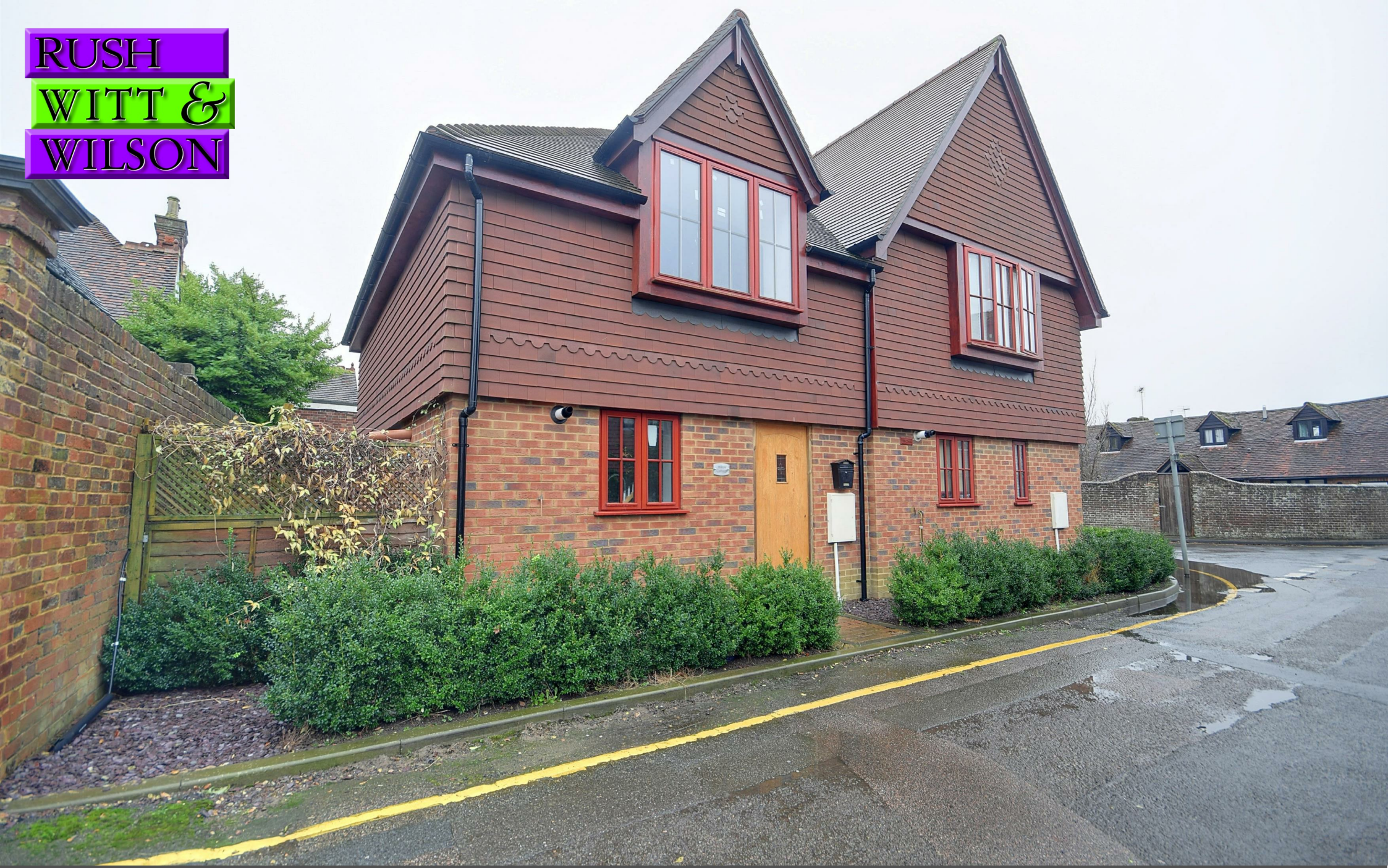
Willow Cottage, Northgrove Road, Hawkhurst, Kent, TN18 4AP. £279,000 OIEO